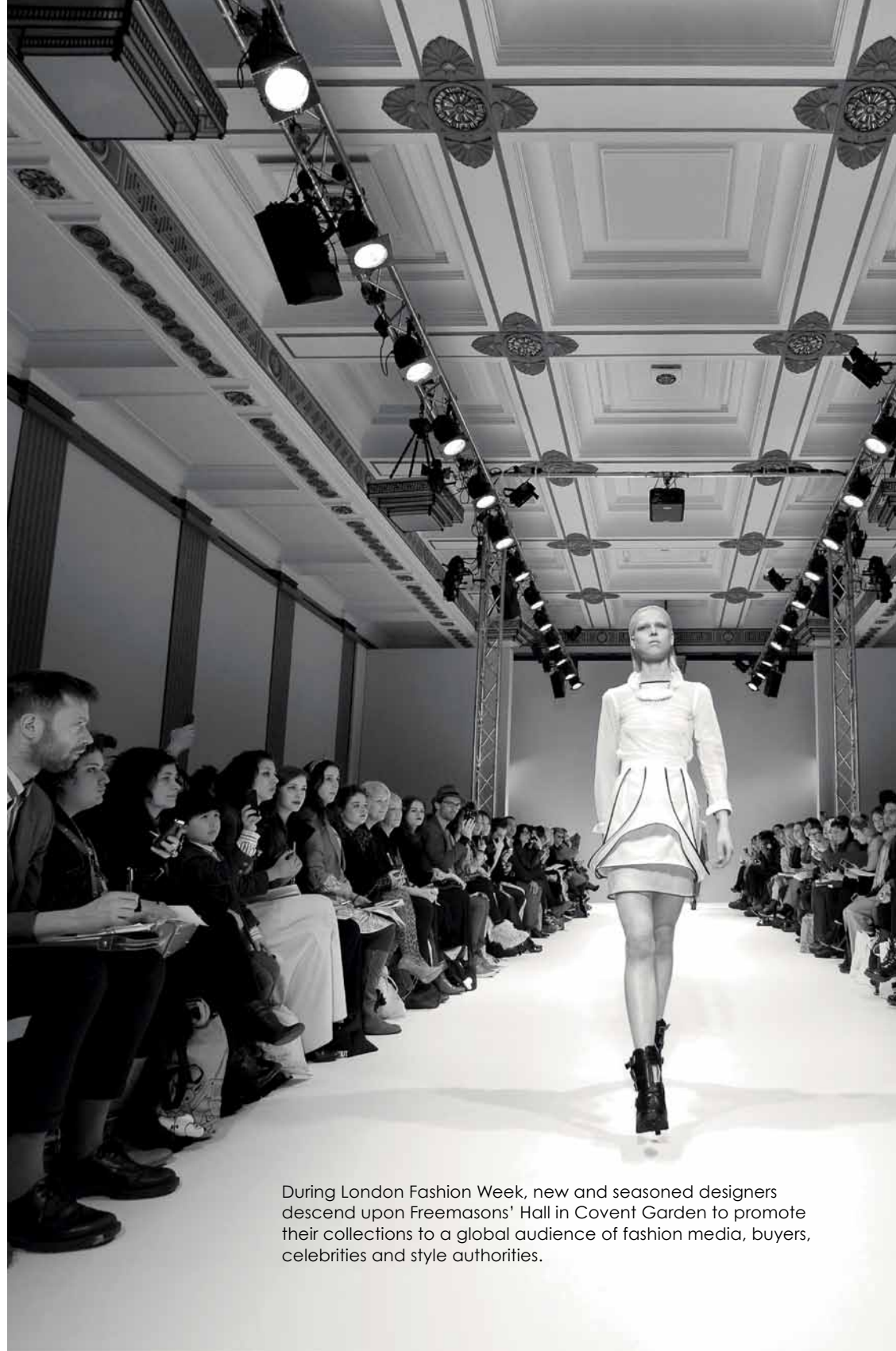
During London Fashion Week, new and seasoned designers descend upon Freemasons' Hall in Covent Garden to promote their collections to a global audience of fashion media, buyers, celebrities and style authorities.